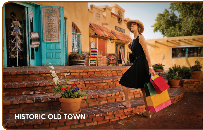
HISTORIC OLD TOWN