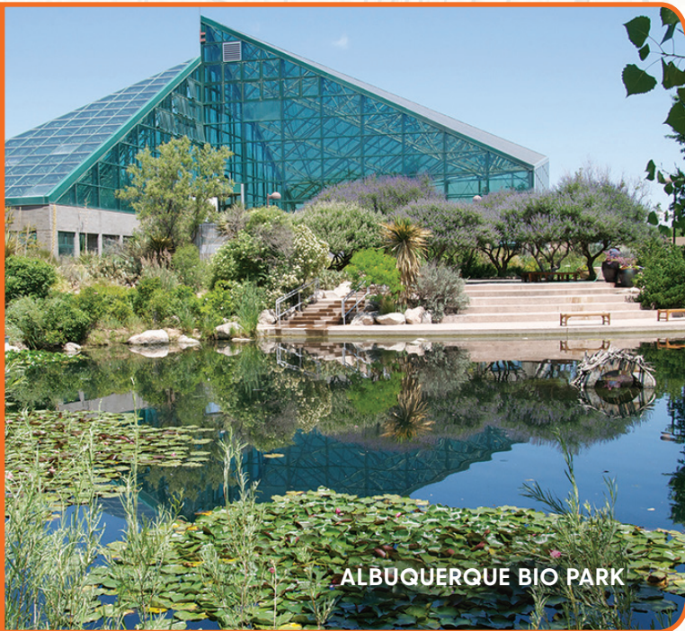
ALBUQUERQUE BIO PARK