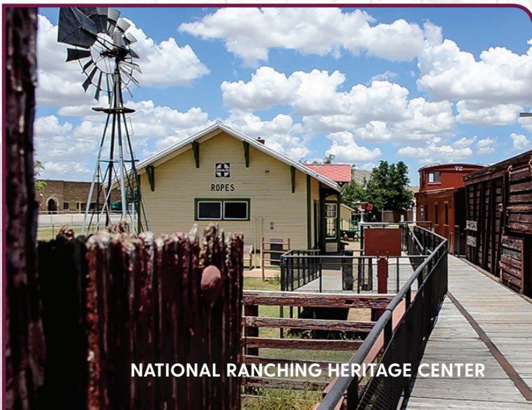
NATIONAL RANCHING HERITAGE CENTER