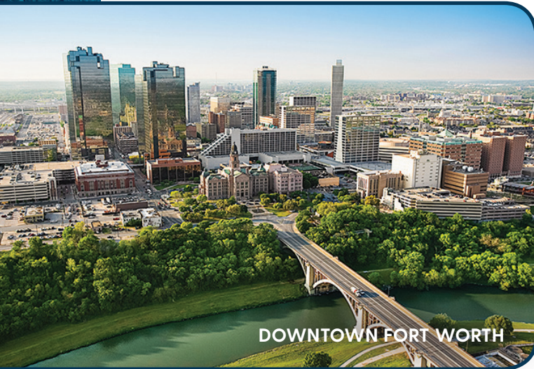
DOWNTOWN FORT WORTH