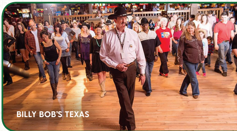
BILLY BOB'S TEXAS