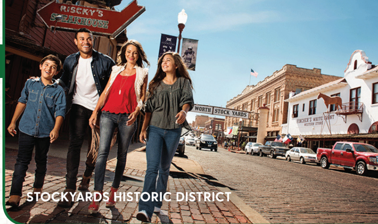
STOCKYARDS HISTORIC DISTRICT

Enjoy dinner in the Stockyards where great BBQ, steaks, or Tex-Mex await you. After dinner enjoy the Championship Rodeo at Cowtown Coliseum ( Fridays & Saturdays at 8:00 p.m. ) and then dance the night away at Billy Bob's Texas, the largest country western entertainment center in the world.