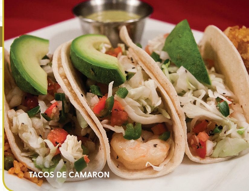
TACOS DE CAMARON

There is no better place to enjoy a New Mexico evening, summer or winter, than the patio at El Pinto. This restaurant, known for its Red Chile Ribs, sits on 12 acres. Be sure to pick up a jar of their delicious salsa, made and bottled on-site, before leaving.