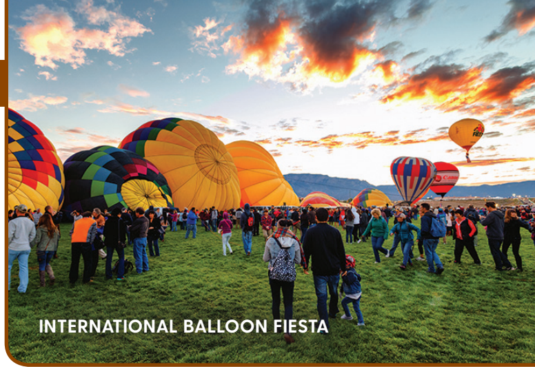
INTERNATIONAL BALLOON FIESTA

The 2.7-mile Sandia Peak Aerial Tramway, the longest aerial tram in the world, starts in the desert and traverses four of the seven life zones in North America. In 15 minutes, you go from desert to spruce-fir forest. From the viewing platform at the High Finance Restaurant at the top, Albuquerque spreads across the Rio Grande Valley like pieces on a game board. Mt. Taylor dots the horizon 65 miles distant. A 3.8-mile trail with stunning views loops below the rim to the Crest House and returns through spruce-aspen forest. In the tram terminal at the base of the mountains, Sandiagito's Mexican Grill serves a fresh lunch (summer) and dinner menu and deli selections.