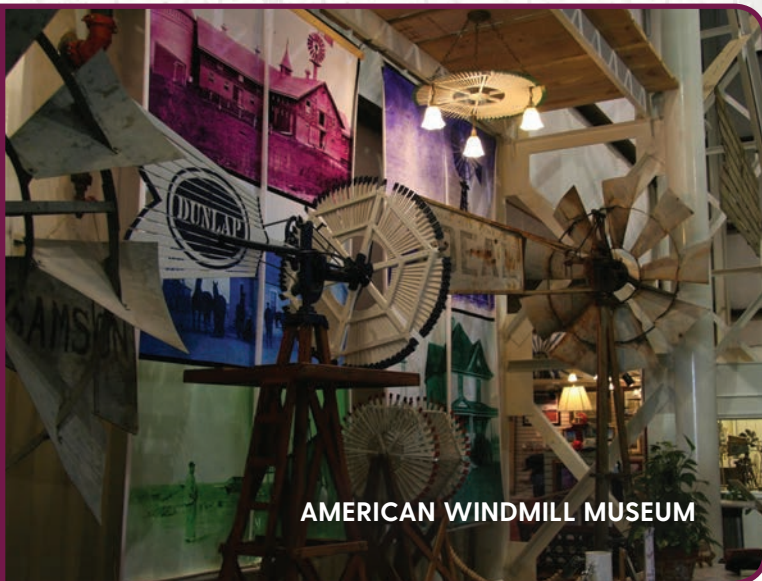
AMERICAN WINDMILL MUSEUM