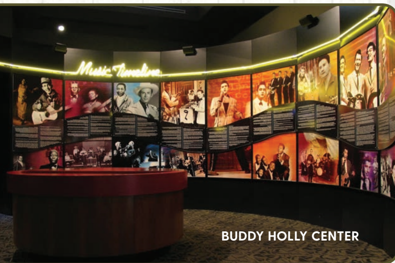
BUDDY HOLLY CENTER