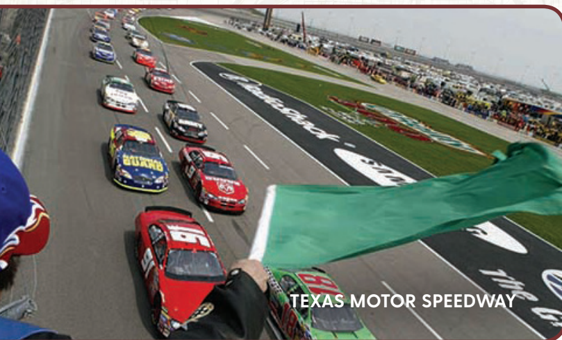
TEXAS MOTOR SPEEDWAY